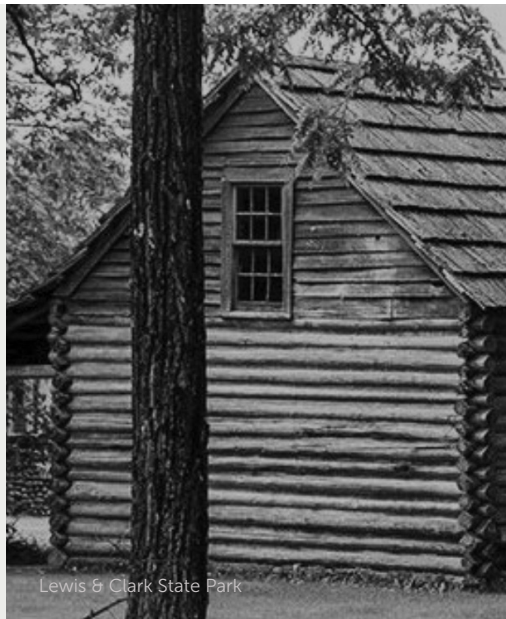
Lewis & Clark State Park

Multiple floods of glacial Lake Missoula shape the geography of this region