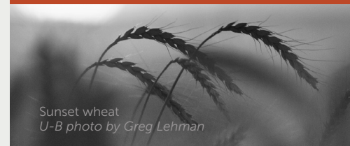
Sunset wheat U-B photo by Greg Lehman

Washington Territorial Legislature grants charter to Whitman Seminary (which becomes Whitman College in 1883)